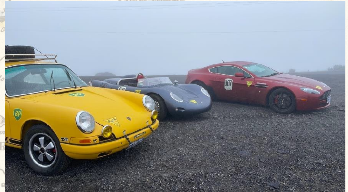
Volcano Irazú, at 3,430m above sea level.

We then drive through the old capital Cartago into the mountains of the Northern Cordillera.