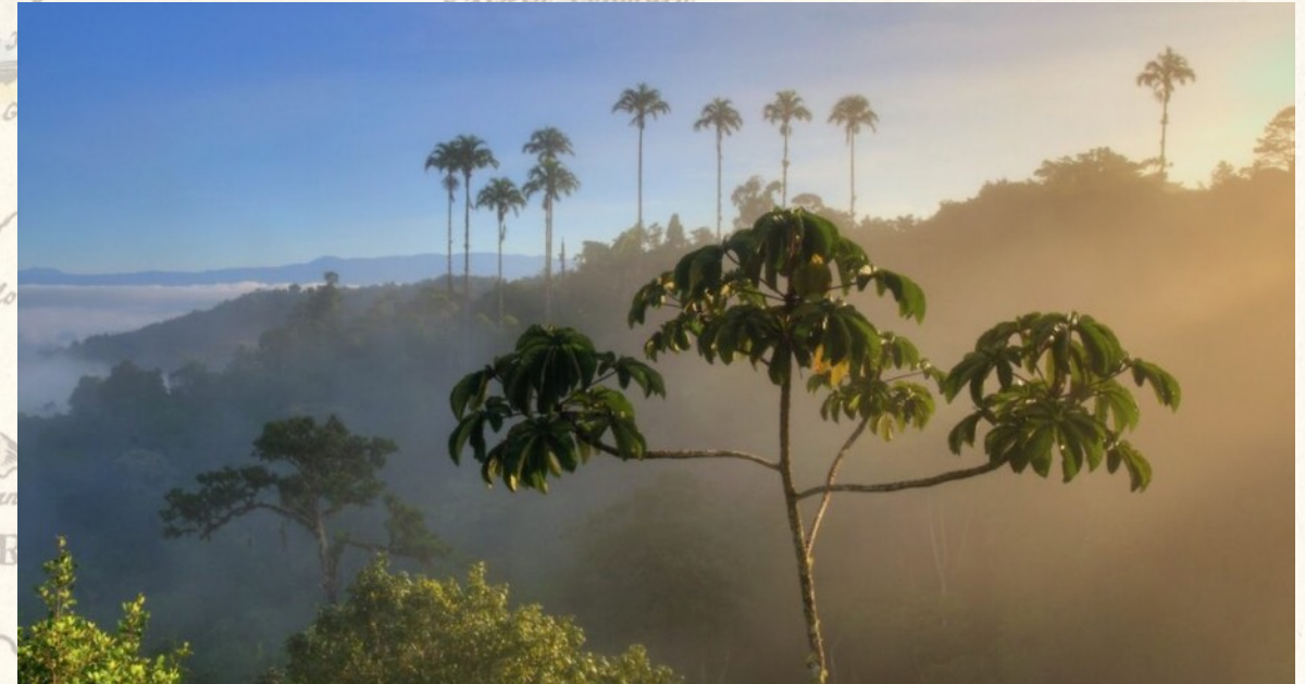
San Vito, southern Costa Rica

Centuries ago, mountain hikers regularly froze to death near the summit - they simply weren't prepared for the temperatures prevailing at over 3,000 meters.