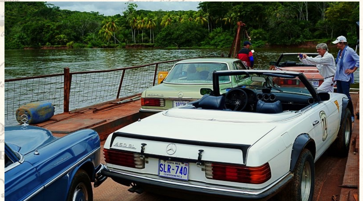
Our ferry across the Rio Sierpe.

If you like Ballermann and Benidorm, well, you'd be in good hands there.