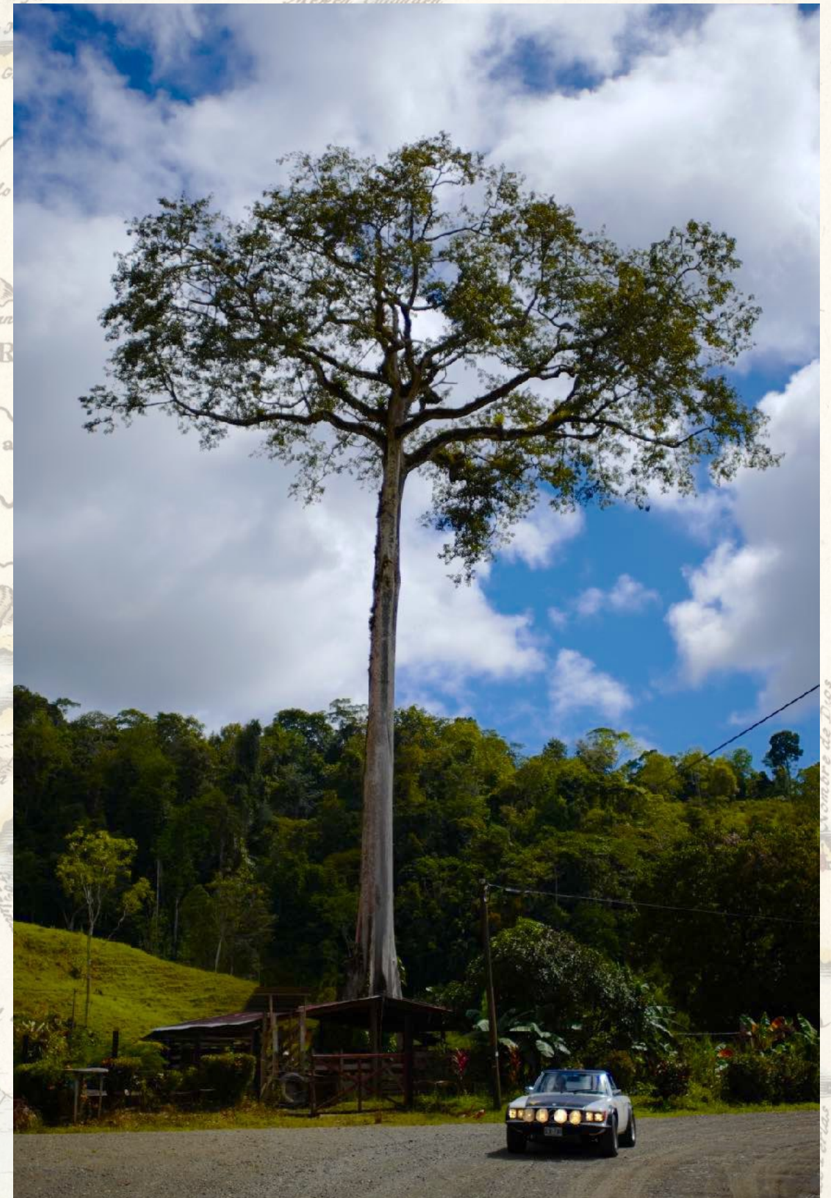
Kapok tree (Ceiba) on the Osa Peninsula

What could be more valuable than enjoying unforgettable moments, pure relaxation, adventure and nature - in a totally relaxed, luxurious atmosphere?