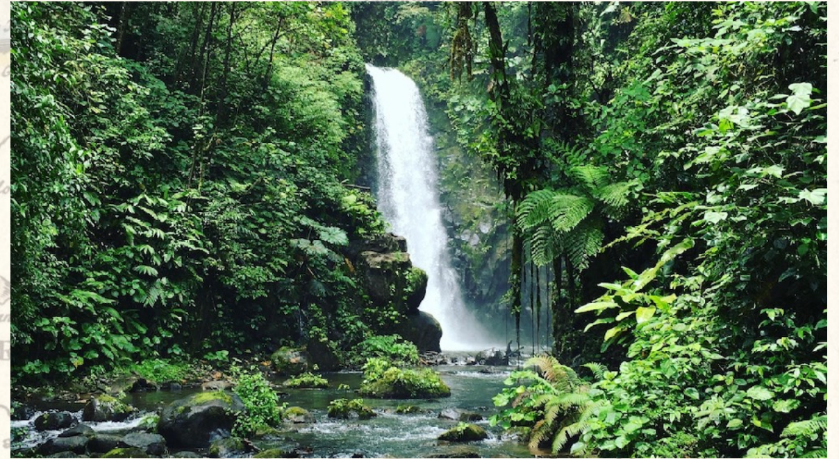
One of the five waterfalls in La Paz Park.