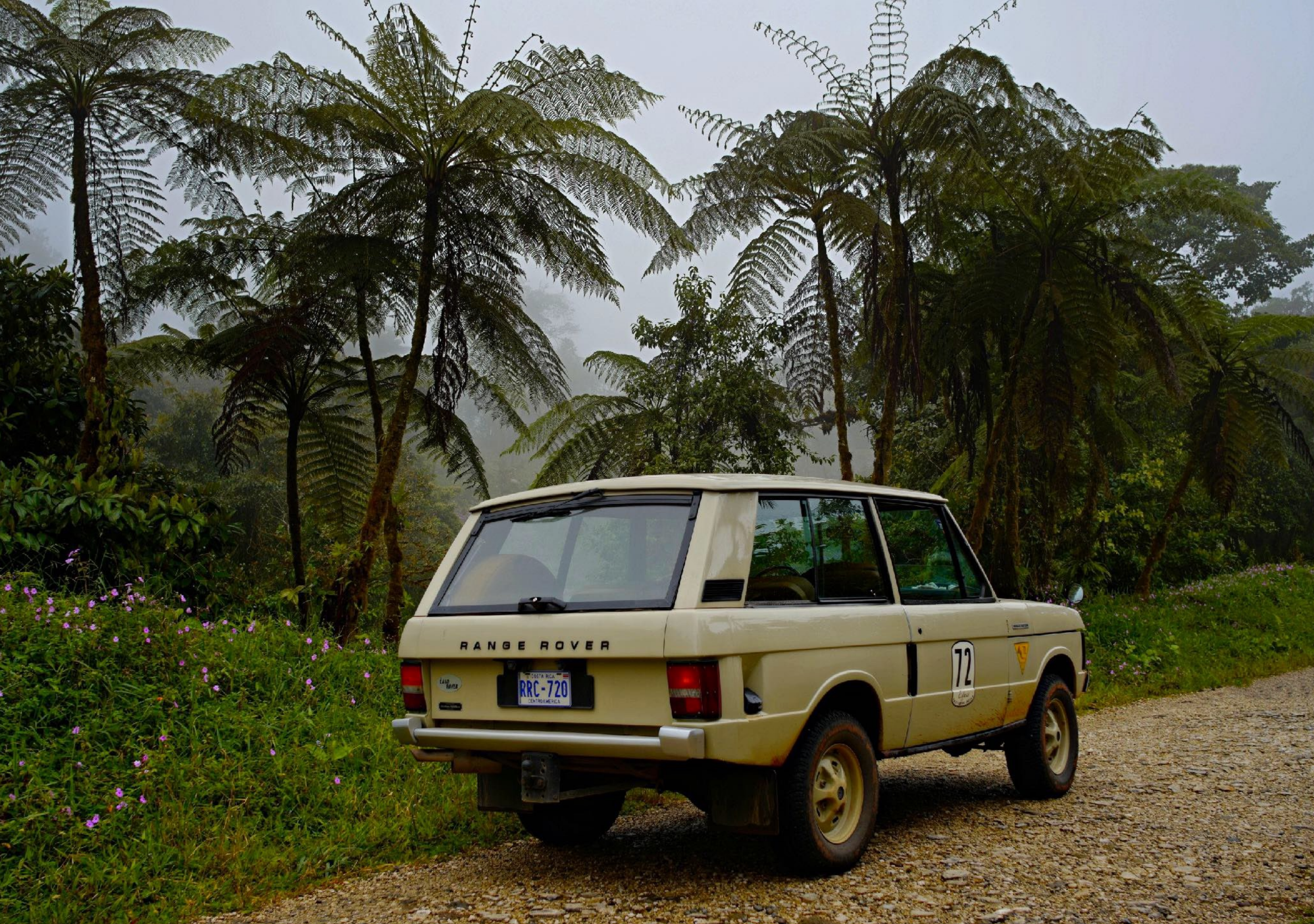
280 Cloud forest near San Vito, southern Costa Rica.