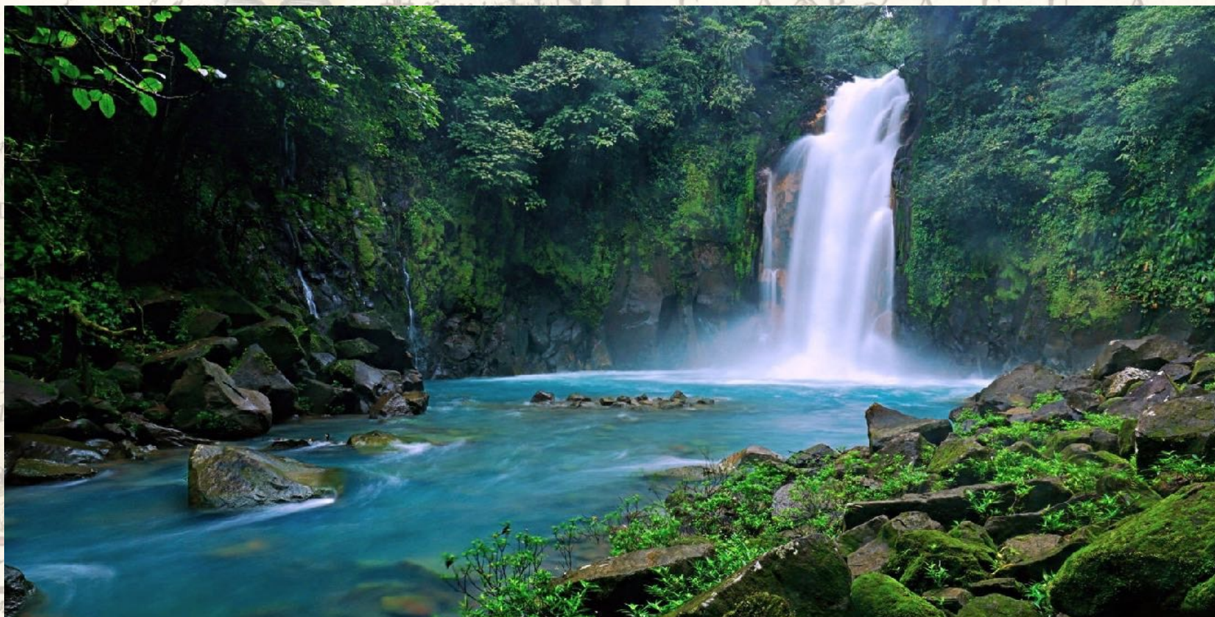
Waterfall Rio Celeste