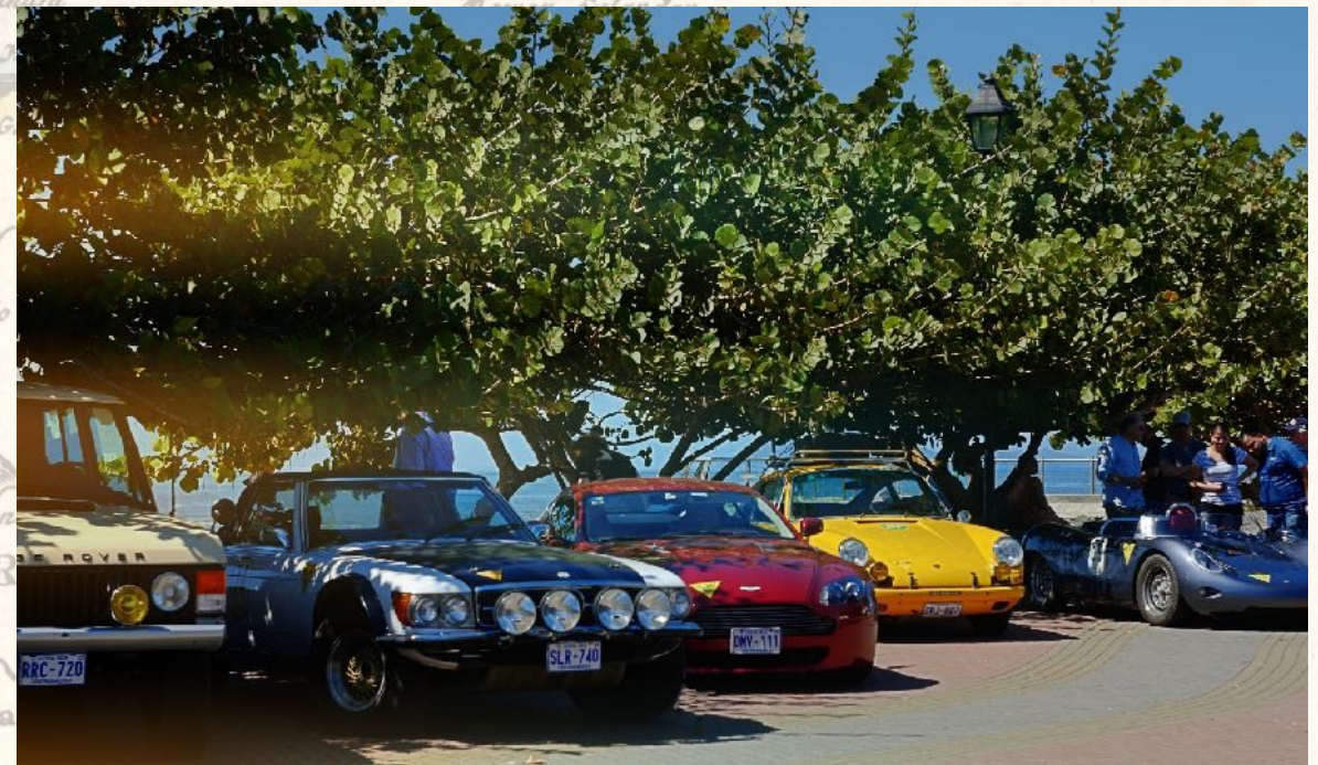
Small harbor town on the Pacific, Puntarenas

As a touring rally vacation, it differs fundamentally from 'normal' rallies and is usually limited to 4 vehicles (plus service vehicle).