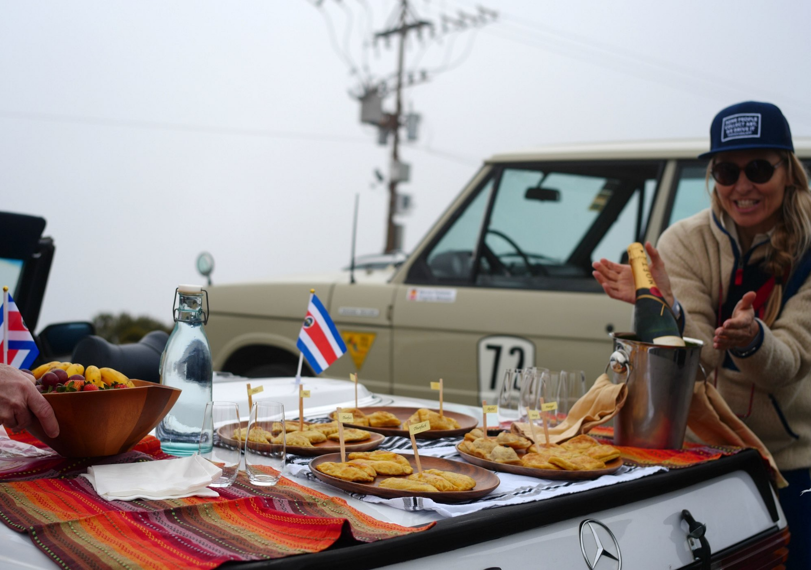
280 Brunch on the Irazú volcano. 3,430m above sea level. Quite refreshing up here. Advantage: the champagne stays cold for longer.

Uitgevoerd te LEYDEN door PIETER VANDER AA met Privilegie.