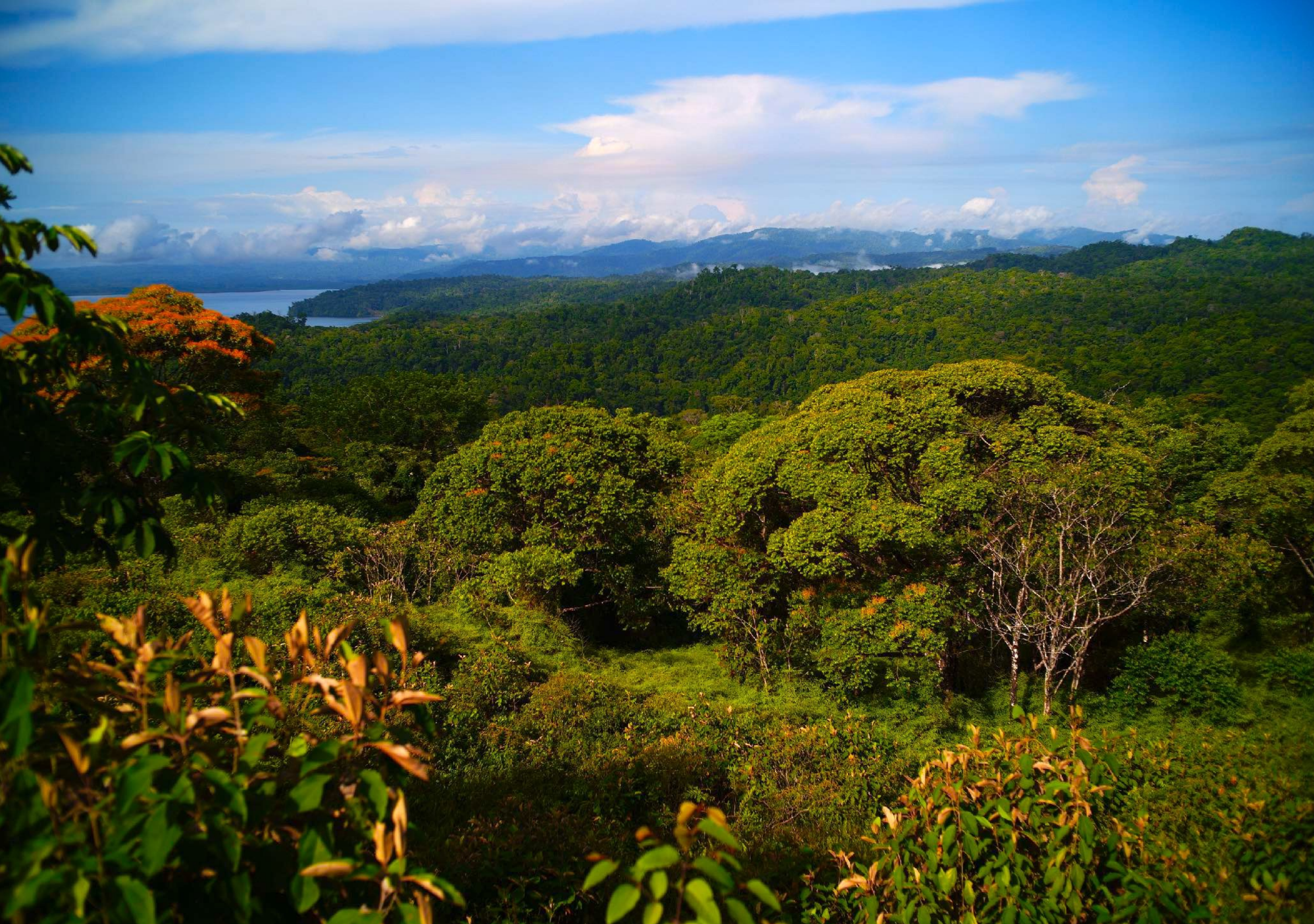
280 Primary forest with overstory, Osa Peninsula, southern Costa Rica. In the background the Golfo Dulce.

Uytgeroerd te LEYDEN door PIETER VANDER AA met Privilegie .