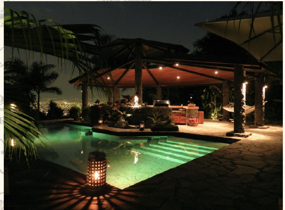
Equis I, Pool & Rancho