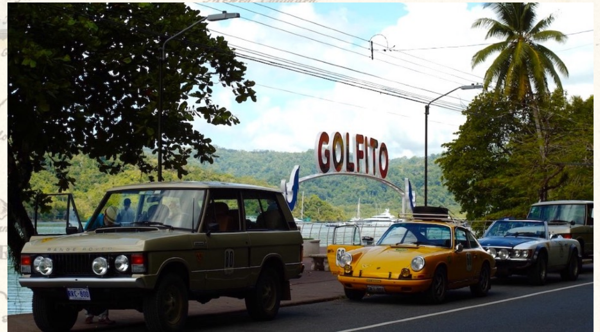
Golfito pier, with the Piedras Blancas National Park in the background.

If you ride without, that is absolutely no problem.