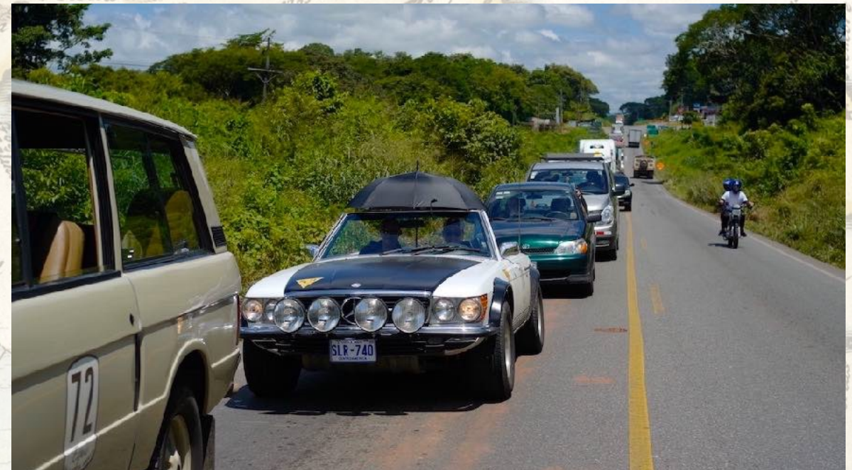
Construction work on the Panamericana - and applied pragmatism.