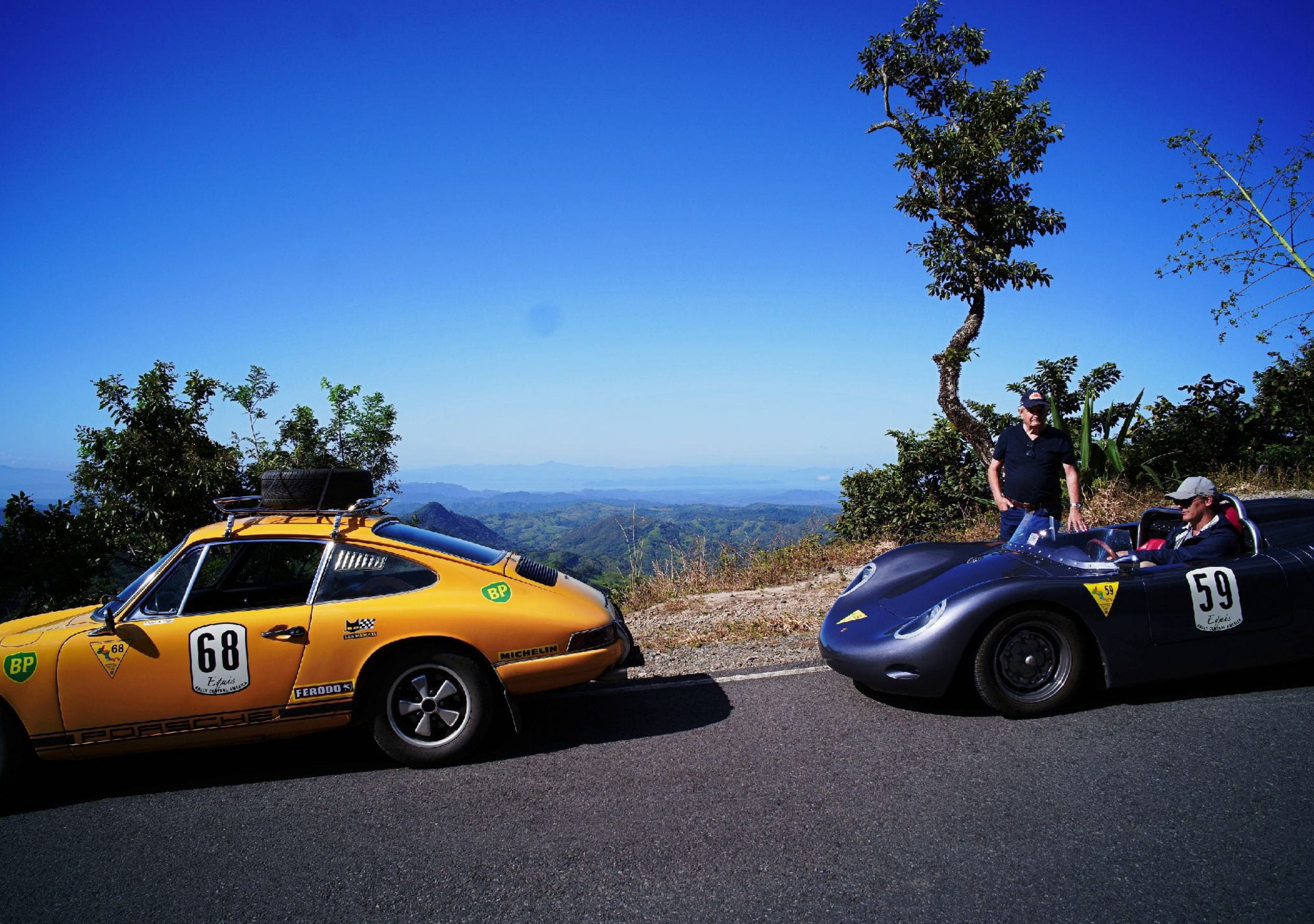
The mountains of Monteverde. The Gulf of Nicoya in the background.

Vygeroerd te LEYDEN door PIETER VANDER AA met Privilegie .