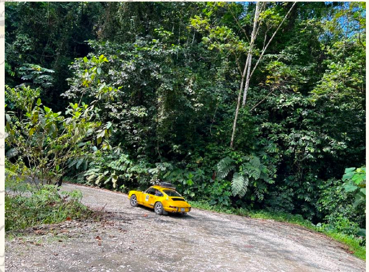
Osa, on the way to the Golfo Dulce.

The area around San Vito boasts beautiful cloud forests and the views sweep across the entire lowlands as far as the Pacific and Panama.