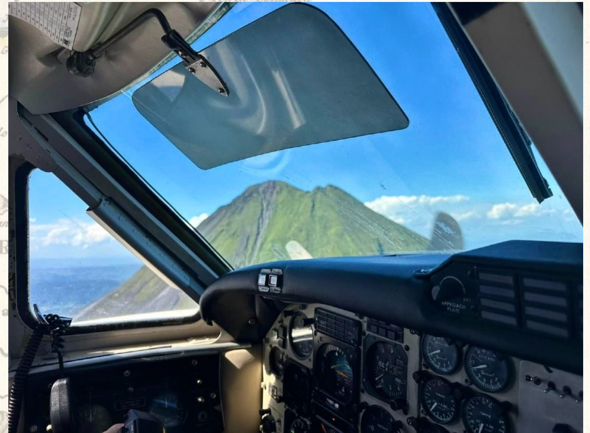
Arenal volcano - but it gets even closer.

With a full stomach, we then visit the oldest colonial church in Costa Rica in Orosí , with an adjoining museum and small monastery. It dates back to 1743 and is still in use. Absolutely worth seeing.