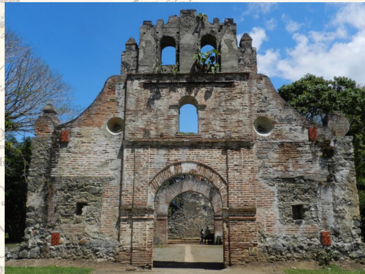
Ruins of Ujarrás

But before that, the golden rule applies: Relax. Relax.