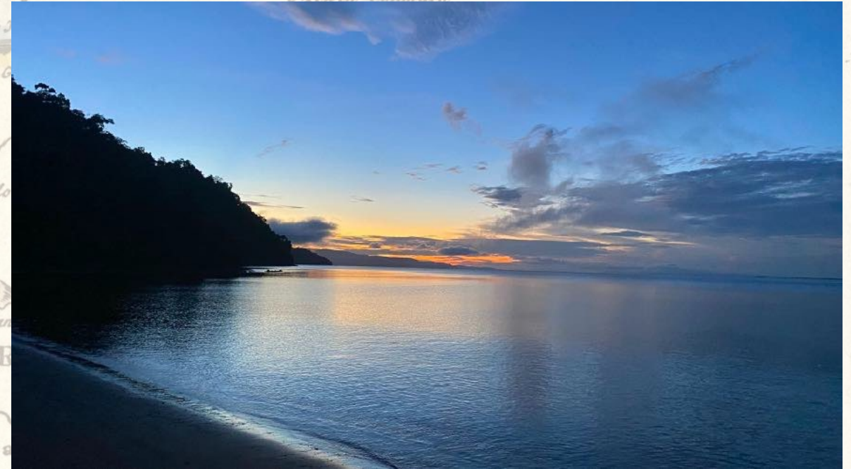
Beach at Kunken Lodge, Golfo Dulce

We could also make a short detour to the old gold mining town of Puerto Jiménez , where you can usually spot monkeys, toucans and macaws, which sometimes like to 'hide' right above our guests.