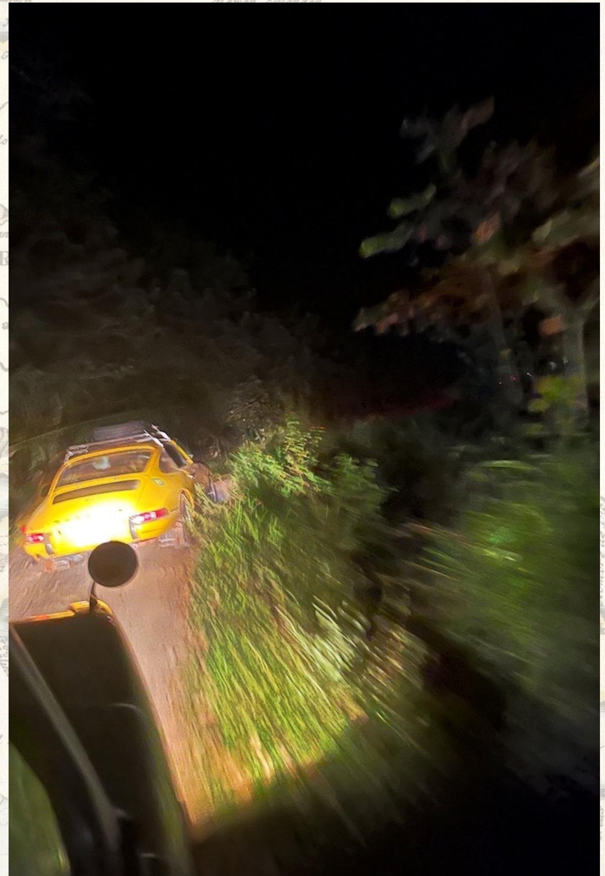
No night rides. Exceptions confirm the rule.

Please ask us about the restaurants, we will be happy to pass on our experience to you.