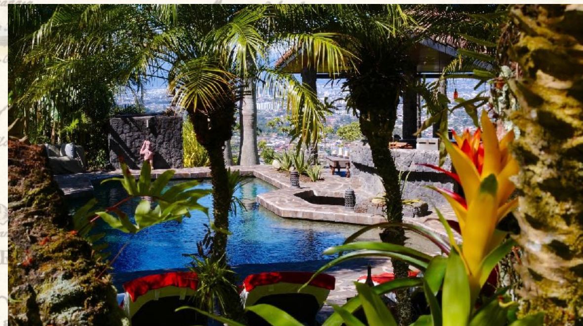
Pool area - Equis I

But before you leave, please relax by the pool.