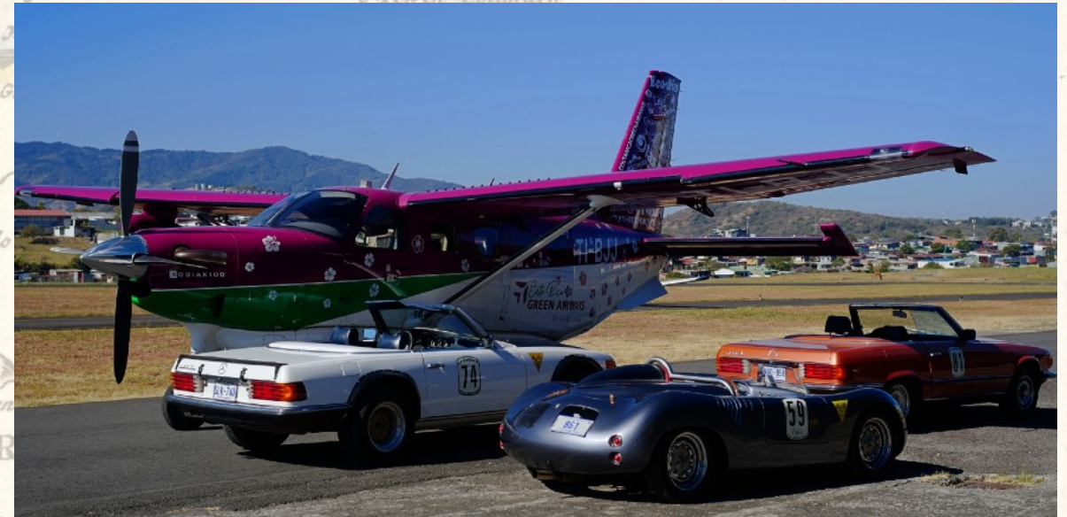
The uncomplicated way of changing vehicles.

For the more adventurous, we have prepared the "Aire & Agua" air and water rally, which is already included in the tour price (for bookings from 2025).