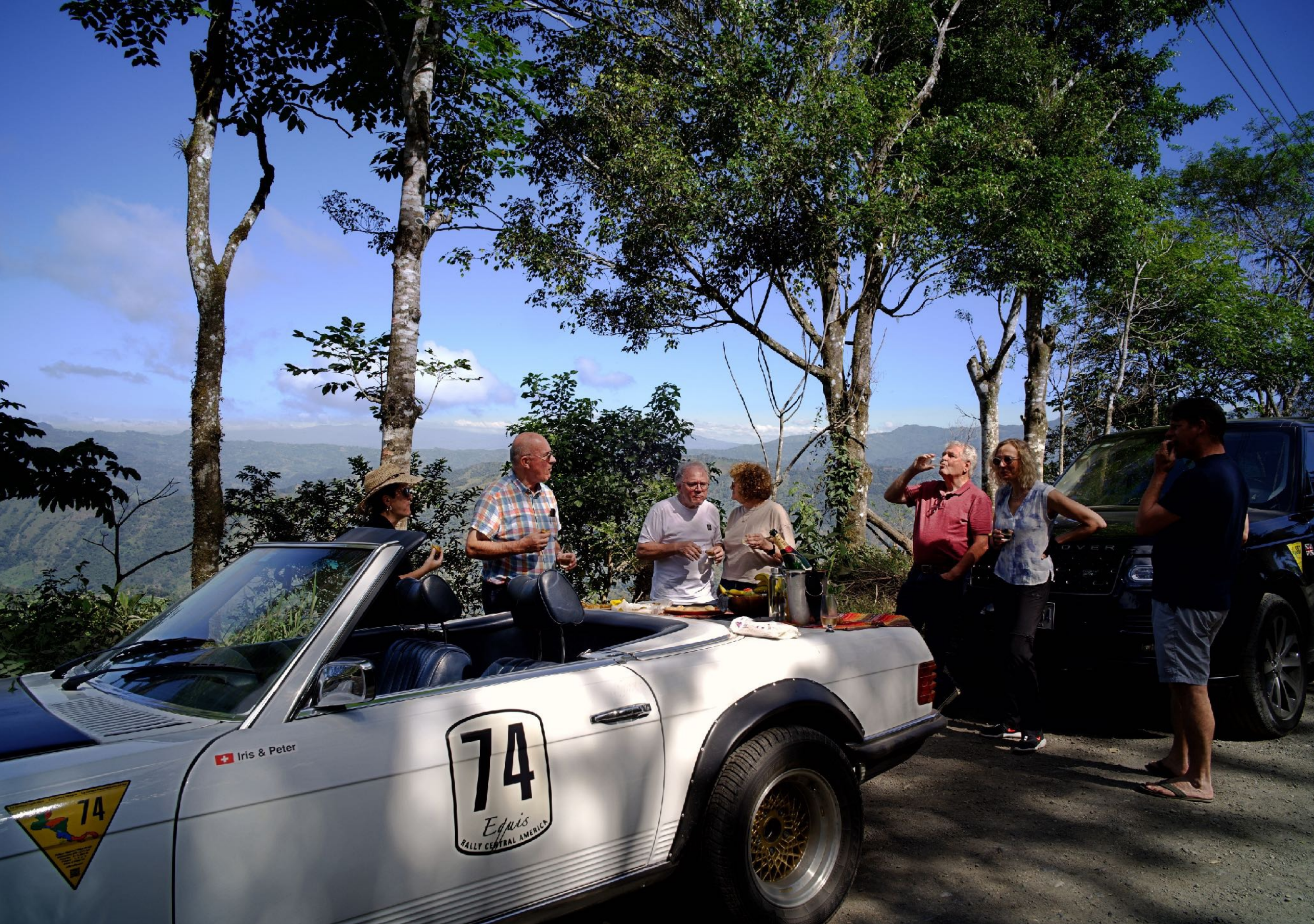
280 An SL makes a wonderful brunch table. 285 Uitgeroerd te LEYDEN door PIETER VANDER AA met Privilegie .