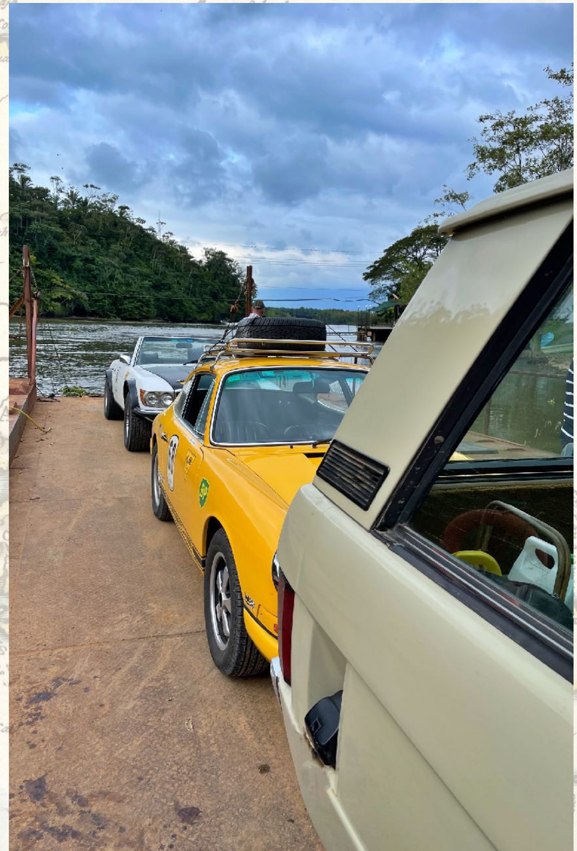
Jungle ferry in Sierpe

Incidentally, the following distances and driving times are purely approximate at a comfortable touring speed and do not include time for stops at places of interest, refueling stops and meals.