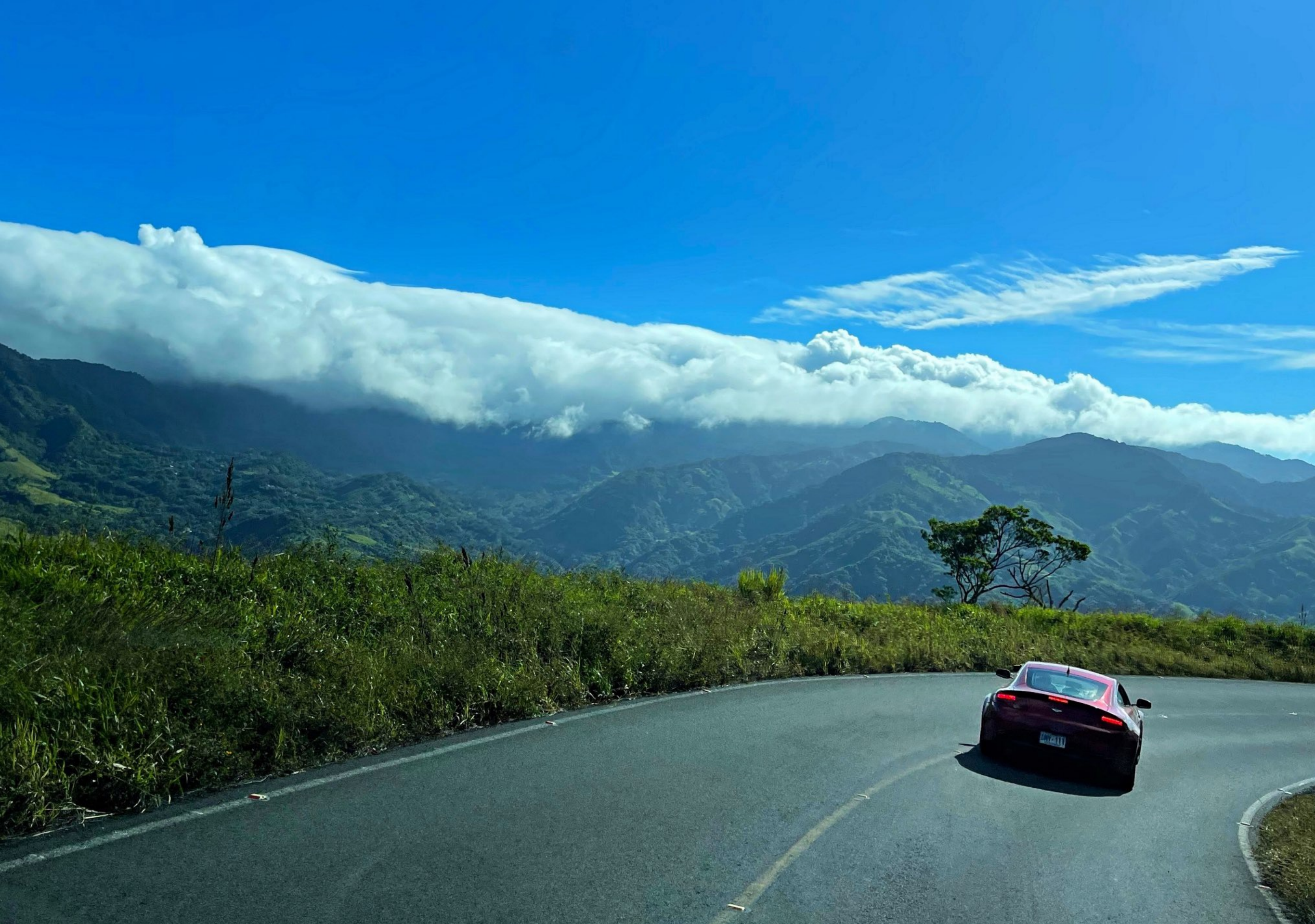
280 One of our service vehicles. Mountains around San Vito, southern Costa Rica. 285

Uitgeroerd te LEYDEN door PIETER VANDER AA met Privilegie .