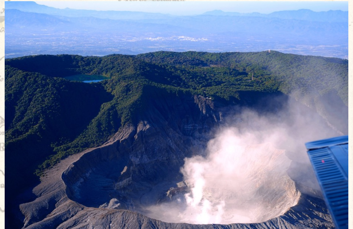
Póas volcano: main crater and crater lake.