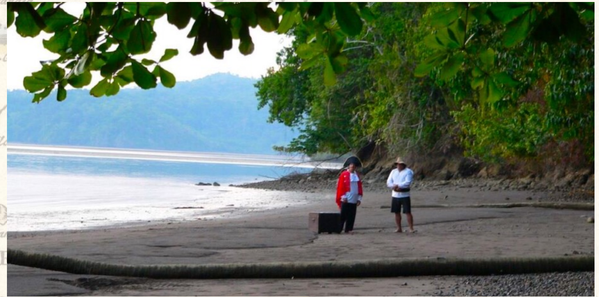
Bahia Equis II, Golfo Dulce.

We arrive in the early afternoon. At the Golfo Dulce , the Sweet Gulf.