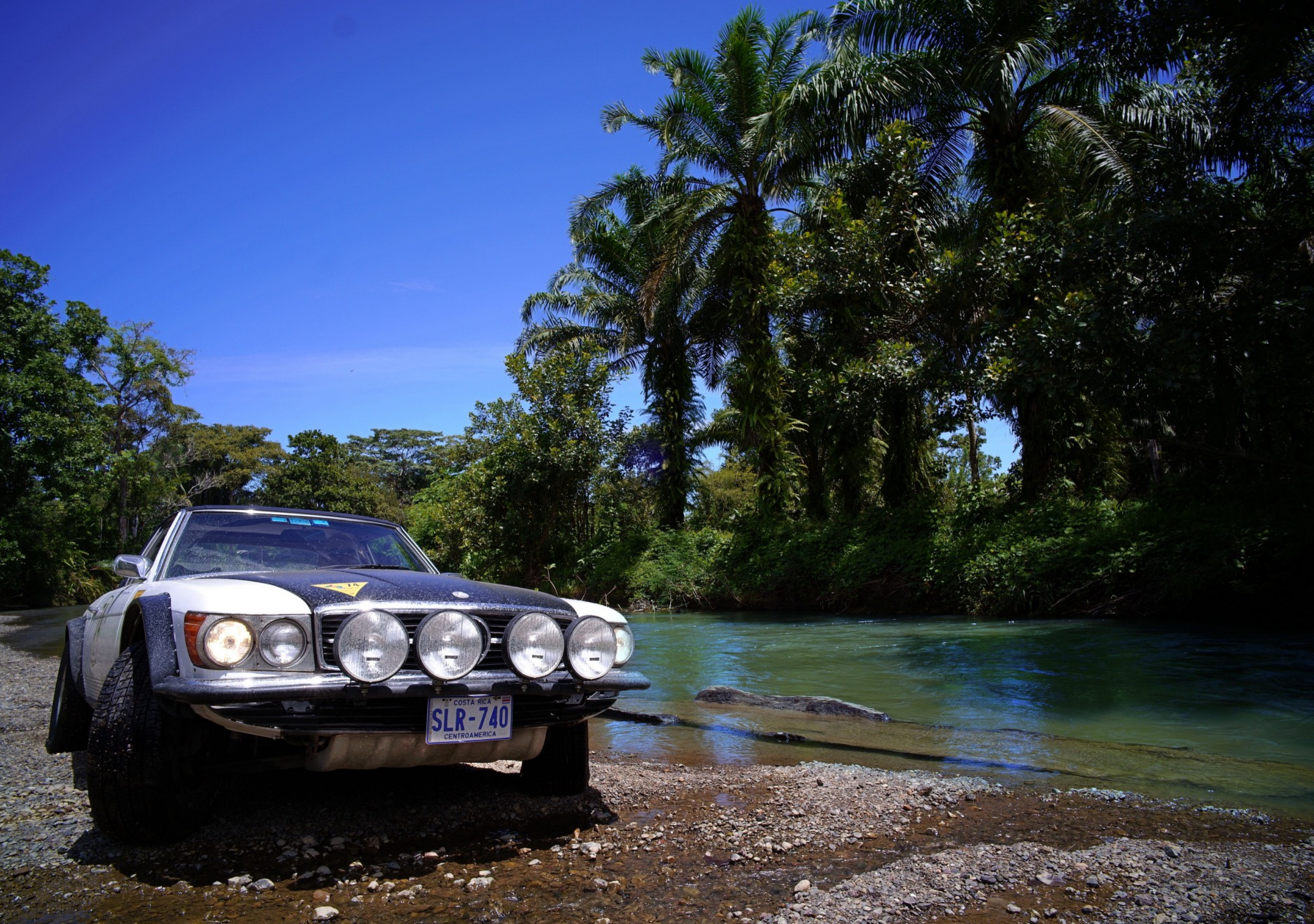
282 Playing in the rainforest, Osa Peninsula, southern Costa Rica.